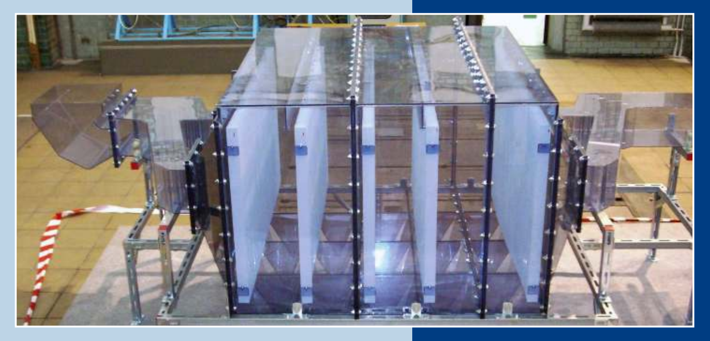
ESP Model at Wroclaw University of Technology

Our R&D activity within the scope of model testing is conducted in co-operation with Wrocław University of Technology. The testing enables plant optimization within the scope of gas flow distribution and aerodynamics in order to achieve high dust removal efficiency for various fuels. Keeping the desired outlet parameters at wide fuel range with variable dust content is of particular importance.