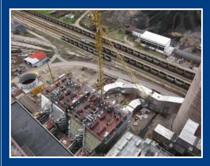
Erection of Unit A6 ESP in Obrenovac

The equipment is applied for dust removal from gas flows within the scope of 10,000 - 40,000 \, \text{m}^3/\text{h} and dust content level 1 to 10 \, \text{g/m}^3 at normall conditions.