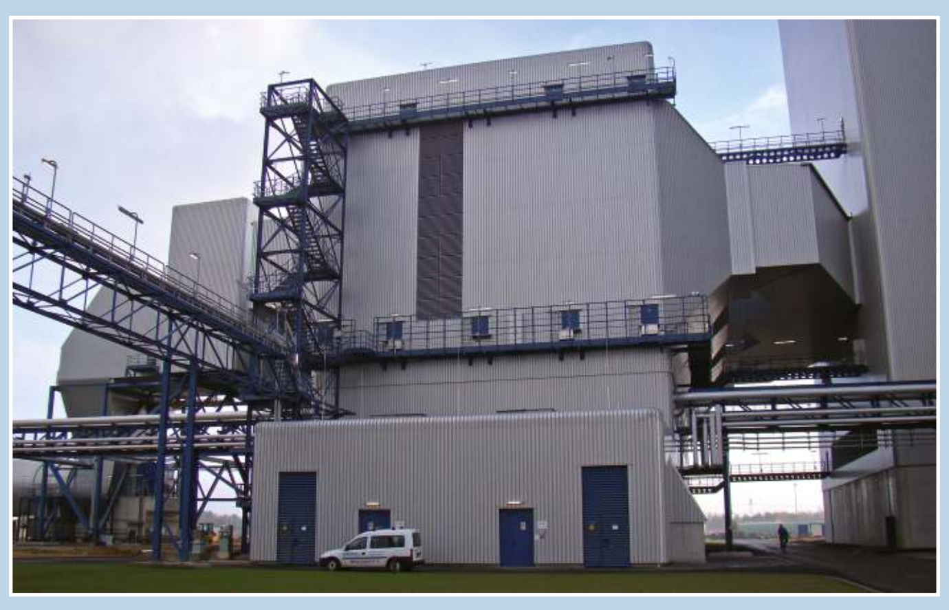
Boxberg Unit no. R-670\,MW- manufacturing, delivery, erection and commissioning